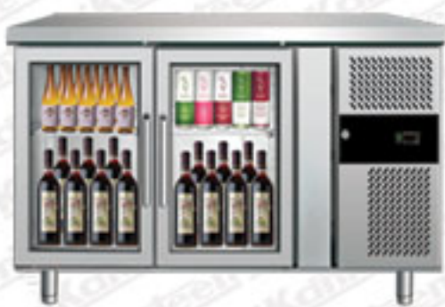
Under Counter - Glass Door