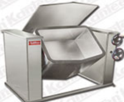
Tilting Brat Pan (Deluxe)