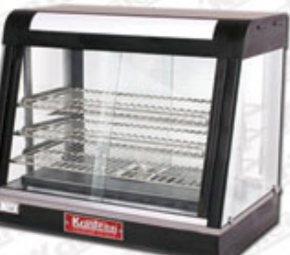
Warming Showcase - Black