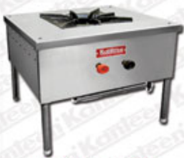
Stock Pot Range