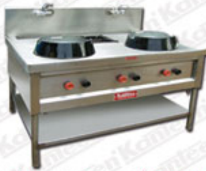
Chinese Range (2B+ISP)