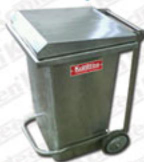
SS Garbage Bin Trolley