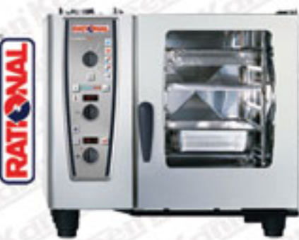
Combi Master Plus - Rational