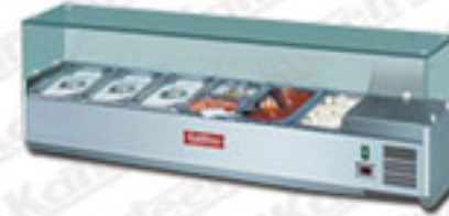
Cold Salad Counter (TT)