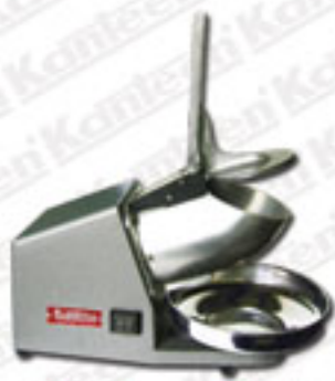
Ice Crusher - Kanteen