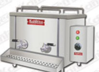
Beverage Dispenser - SS