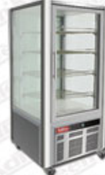
Panoramic Cold Showcase