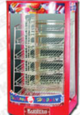
Warming Showcase - Vertical