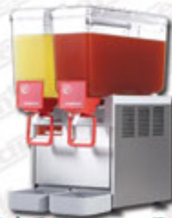
Drink Dispenser - Double Jar