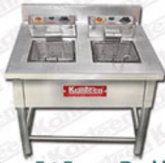
Deep Fat Fryer - Double