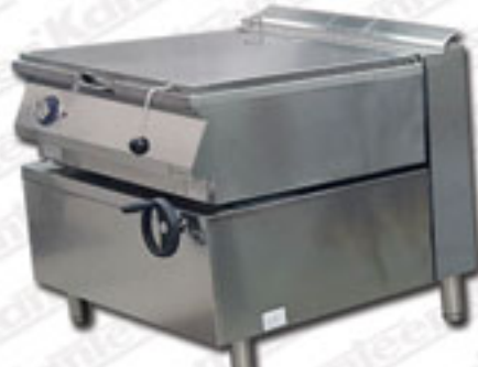
Tilting Brat Pan (Electrolux)