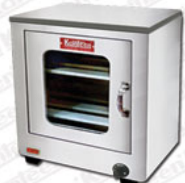
Hot Case - HF-1/2/3