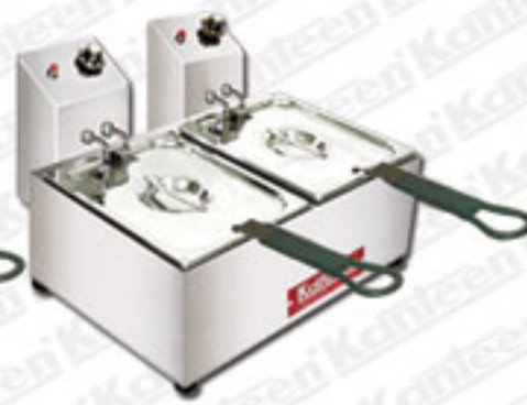
Deep Fat Fryer - Double