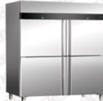
4 Door Reach In