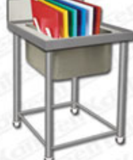
Chopping Board Sterilizer