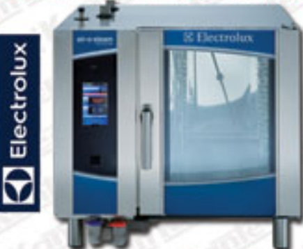
Combi Oven - Electrolux