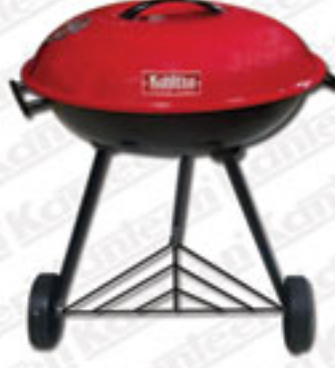
Bar-B-Que - Red