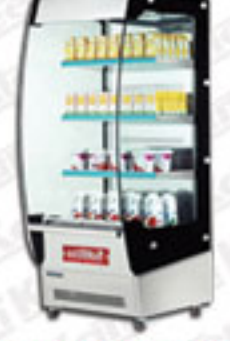
Slim Multi Deck Chiller