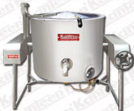
Rice Boiler (Standard)