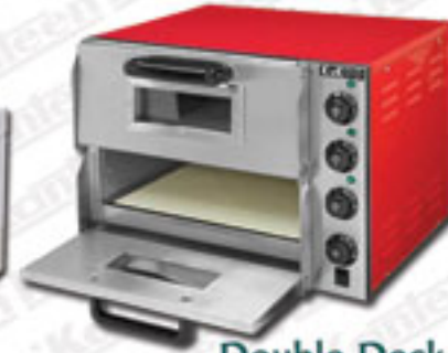
Double Deck Pizza Oven - Stone Base