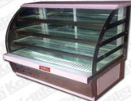
SS Bend Glass Showcase Deluxe with Granite Top