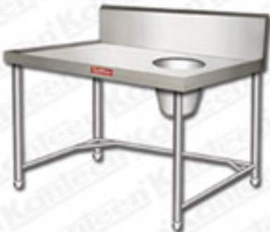
Soiled Dish Landing Table