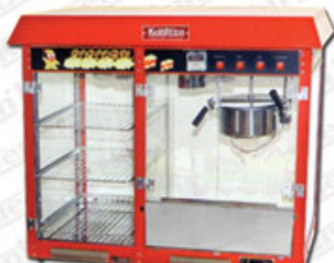
Popcorn Maker with Warmer