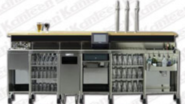
Mocktail / Cocktail Station