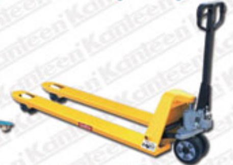
Hydraulic Pallet Truck