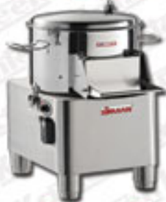
Potato Peeler - Floor