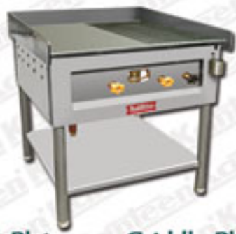
Hot Plate cum Griddle Plate