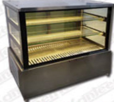
Flat Glass Showcase