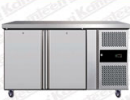
Undercounter - 2 Door