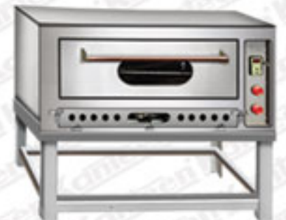
Single Deck - Standard