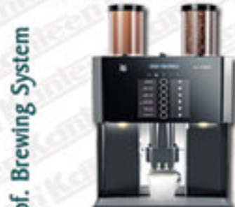
Prof. Brewing System