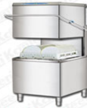
Hood Type Dishwasher