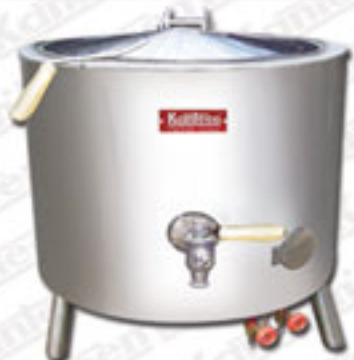
Rice Boiler / Bulk Boiler