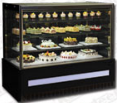
Flat Glass Cold Showcase