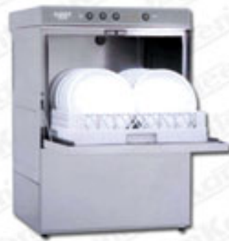
Under Counter Dishwasher