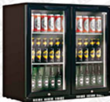
Back Bar - 2/3 Doors