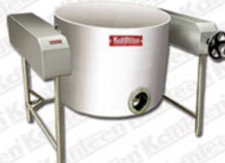
Tilting Frying Pan