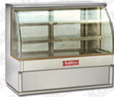
SS Bend Glass Showcase Standard