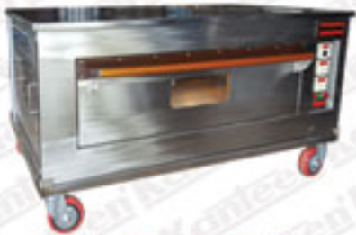
Single Deck - Deluxe