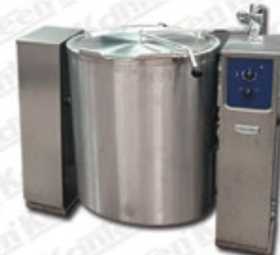
Tilting Boiler (Electrolux)