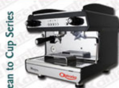
Bean to Cup Series