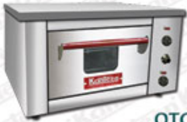
OTG Baking Oven - SS/OV-1