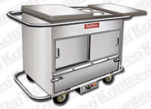
Bain Marie Trolley