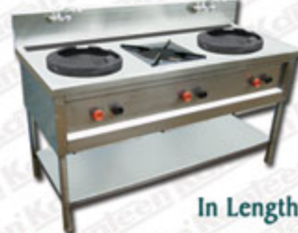
Chinese Range (2B+ISP)