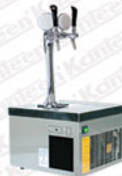
Draught Beer Sys.