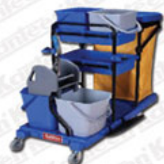
Multi Function Cart