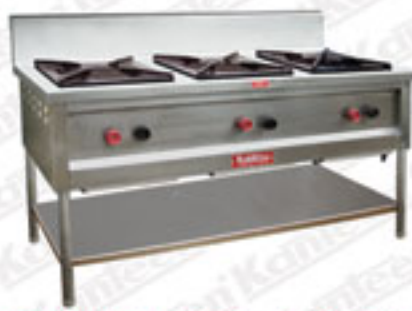
Cooking Range - 3 Burner