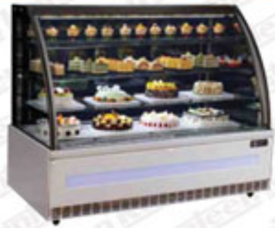
Curved Glass Cold Showcase Imported