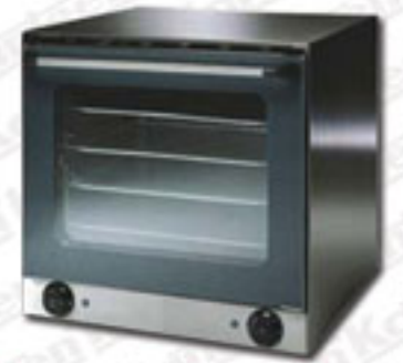
Convection Oven - Electric