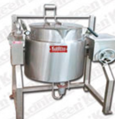
Steam Jacketted Vessel