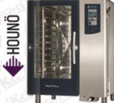
Combi Oven - Houno