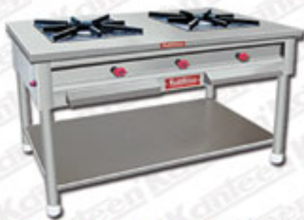
Cooking Range - 2 Burner