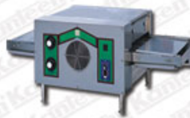
Conveyor Pizza Oven