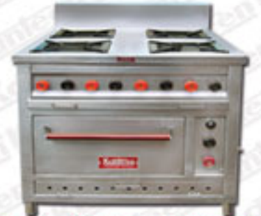
Conti. Range - 4 Burner