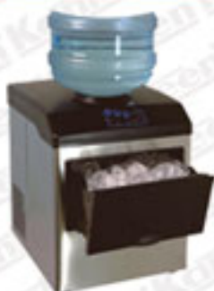
Mini Ice Machine