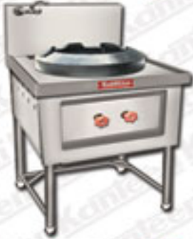
Chinese Range - 1 Burner