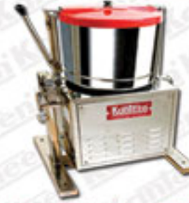
Wet Grinder - Tilting