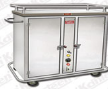
Hot Food Trolley