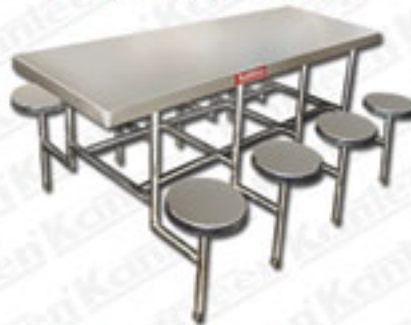
Dining Table - 8 Seat