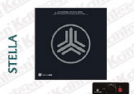
Induction - Wok Type