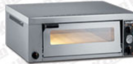
Deck Oven - Electric