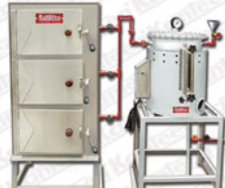
Idly Plant - 240 / 300 Idlys