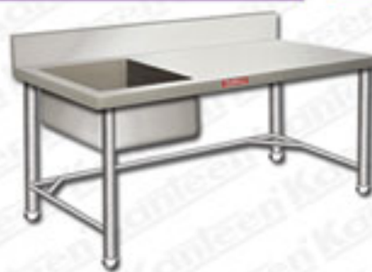
Work Table with Sink