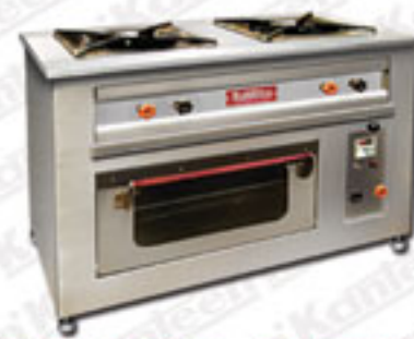
Conti. Range - 2 Burner