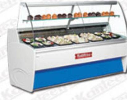
Serve Over Counter