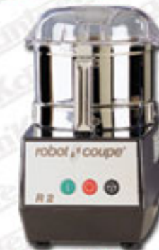
Vegetable Cutter Mixer