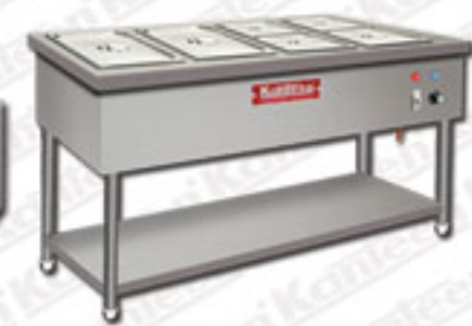
Bain Marie with 1 Bottom Shelf