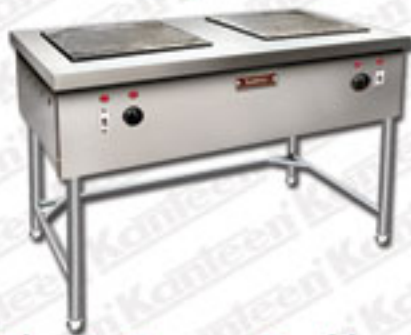
Electric Range - Double