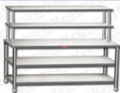
Work Table 2 BS & 2 OHS