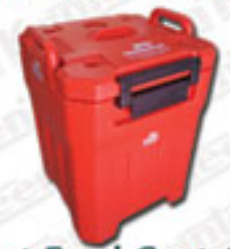
Hot Food Container