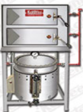
Idly Plant - 120 Idlys