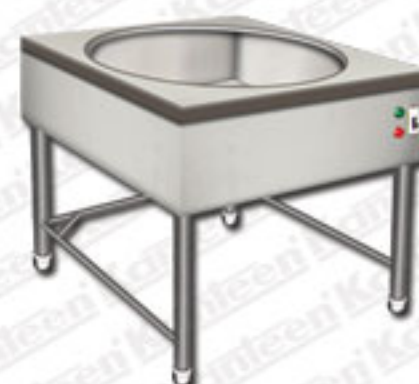
Biryani Handi Warmer