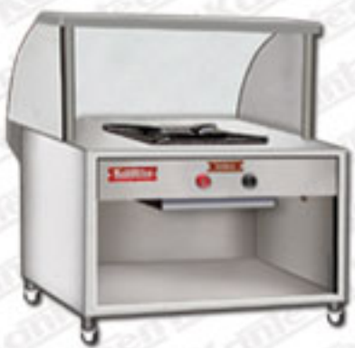
Roll / Chap Counter