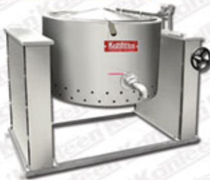
Tilting Boiler (Deluxe)