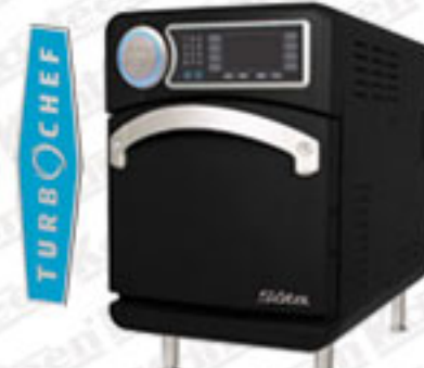
Turbochef Speed Oven