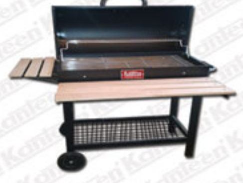
Bar-B-Que - Commercial