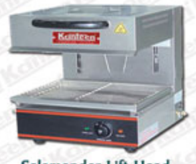
Salamander Lift Head