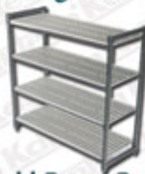
Cold Room Rack