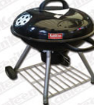
Bar-B-Que - Black (Dlx)