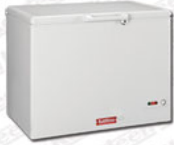
Chest Freezer - Hard Top