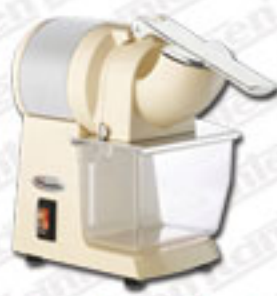
Ice Crusher - Santos