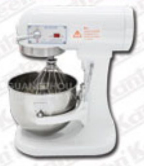
Beater - B-5 / B-7