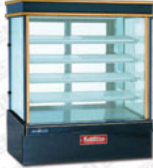
Showcase - Vertical