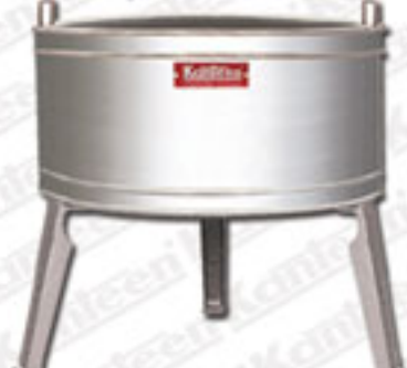
Sigree / Frying Pan