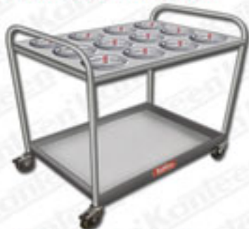
Spice Table / Trolley