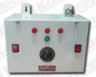
Auto Control Box