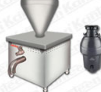
Garbage Crusher / Liquidizer