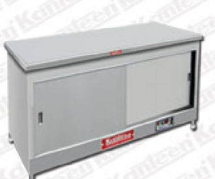
Hot Case - HF - 4/5