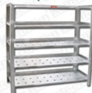
Clean Dish & Glass Rack