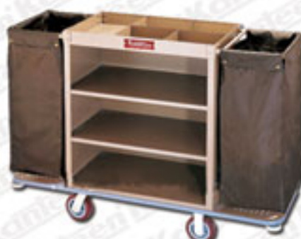
House Keeping Trolley (Impt)