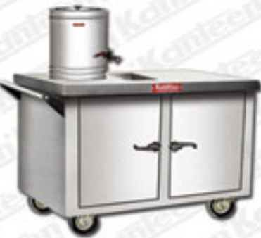
Tea & Snacks Trolley