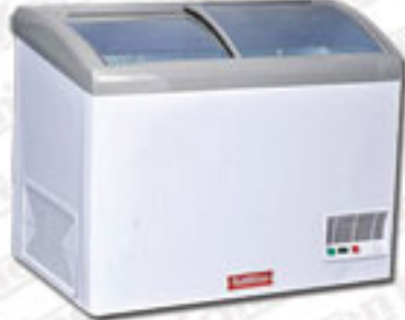
Chest Freezer - Curve Glass