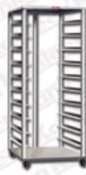
Open Tray Trolley