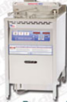
Broaster Pressure Fryer