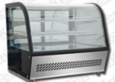
Table Top Cold / Hot Showcase