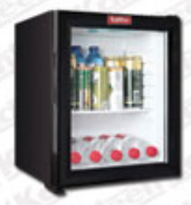
Min Bar - Glass