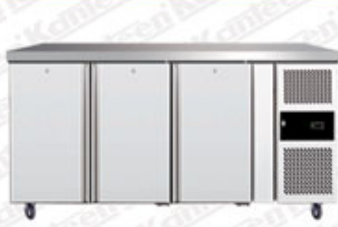
Undercounter - 3 Door