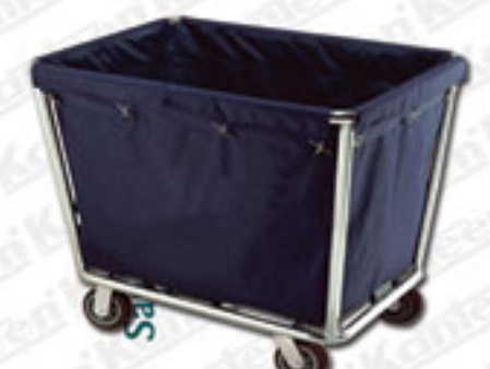
Linen Trolley - Square