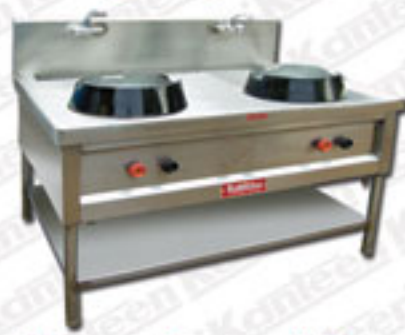
Chinese Range - 2 Burner