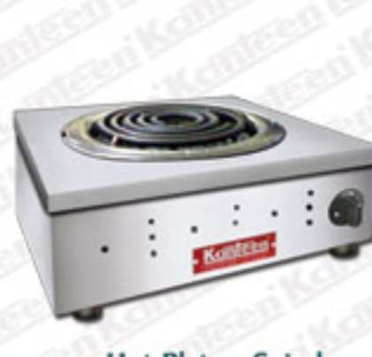
Hot Plate - Spiral