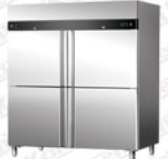
Combi Reach In