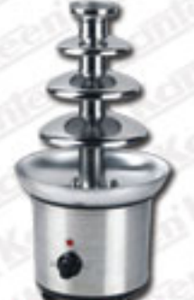
Hot Chocolate Fountain