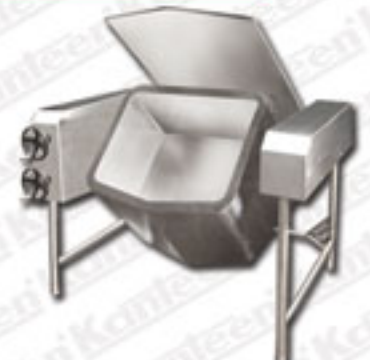
Tilting Brat Pan (Standard)