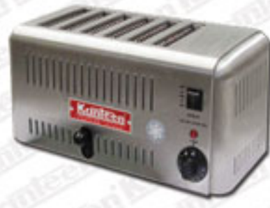
Pop Up Toaster