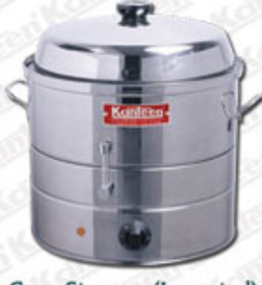
Corn Steamer (Imported)