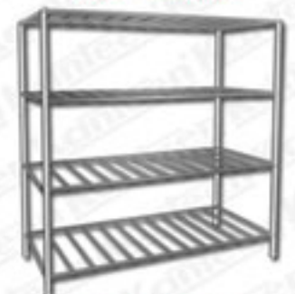
SS Pot Rack