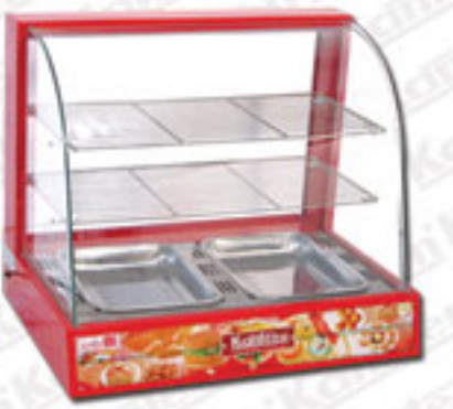
Warming Showcase - Red