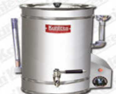
Milk Warming Urn