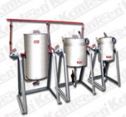
Steam Cooking Plant