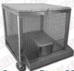
Storage Bin - SS