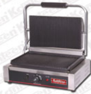
Sandwich Griller (Imported)