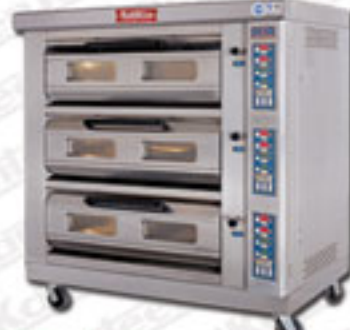
3 Deck Oven - Imported