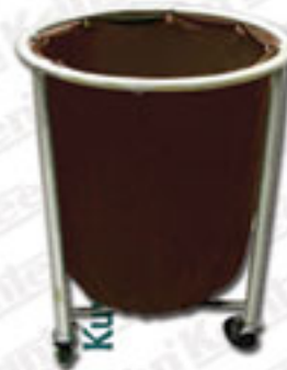
Linen Trolley - Cylindrical