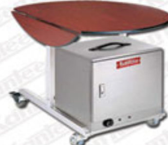
Room Service Trolley