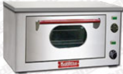
Baking Oven - POV 1/2/3