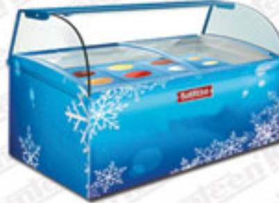
Ice Cream Parlour