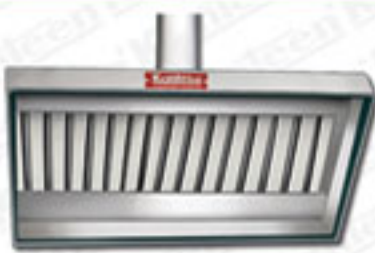
Exhaust Hood - Standard