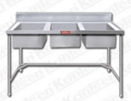
Triple Unit Sink