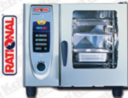
Self Cooking Centre