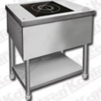
Induction Range - Single