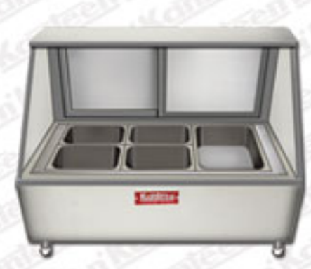
Bain Marie Display Counter