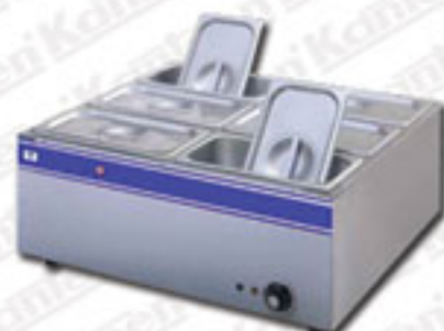
Bain Marie Counter Top - Imp