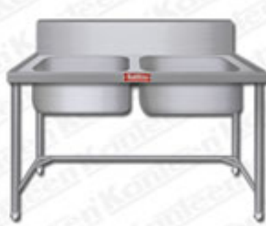
Double Unit Sink