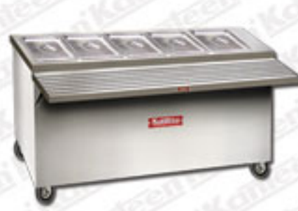
Bain Marie with 3 Sides Cover & Tray Slide