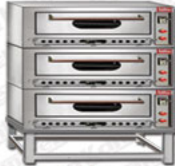
3 Deck Baking Oven