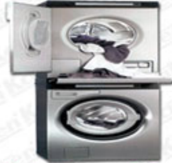
Washer Extractor & Dryer