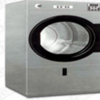
100% Cloth Dryer