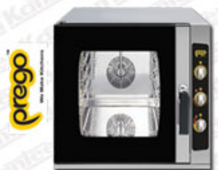
Combi Oven - Prego