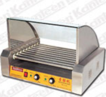
Hot Dog Roller