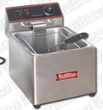
Deep Fat Fryer - (Imported)