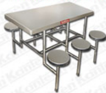
Dining Table - 6 Seat