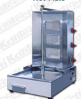
Shawarma Grill Gas