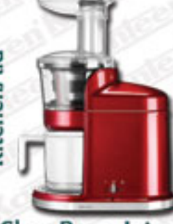
Slow Press Juicer