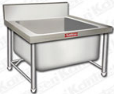
Pot Wash Sink