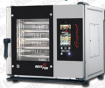
Combi Oven - Best For