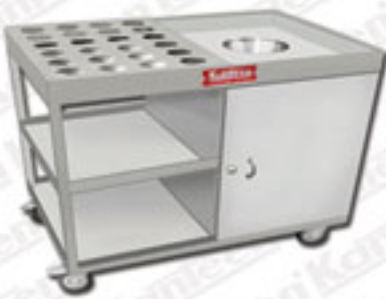
Soild Dish & Glass Trolley