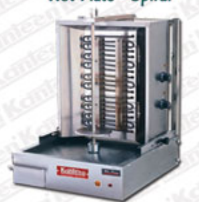
Shawarma Grill Electric