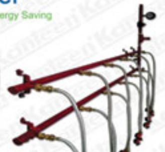
Gas Bank Manifold