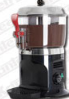
Hot Chocolate Dispenser