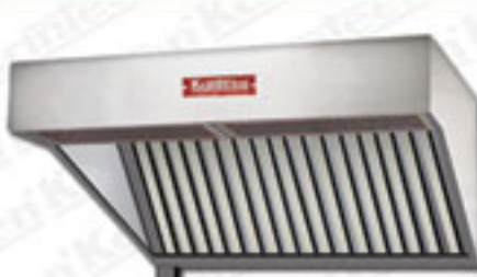
Exhaust Hood - Combi