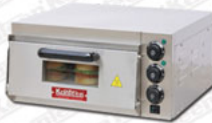
Pizza Oven - Stone Base