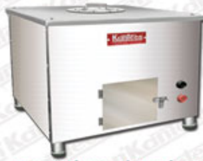
Gas / Charcoal Tandoor