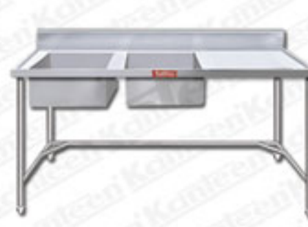
Double Sink with Drain Board