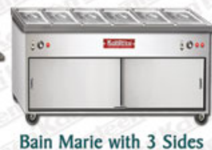
Bain Marie with 3 Sides Cover, Sliding Door & Hot Case