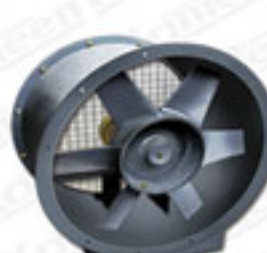
Axial Flow Fan