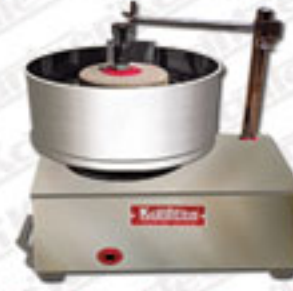
Wet Grinder - Standard