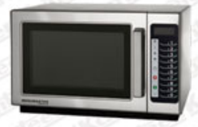
Micro Oven - Menumaster