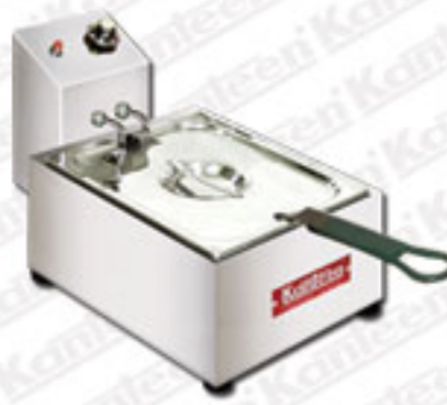
Deep Fat Fryer - Single