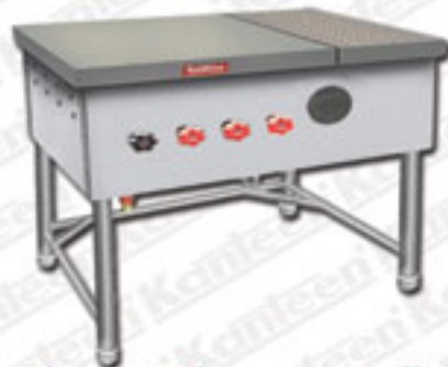
Chapatti Plate cum Puffer