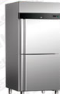
2 Door Reach In