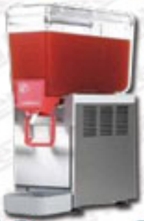
Drink Dispenser - Single Jar