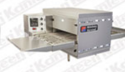
Middleby Marshall Oven