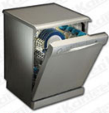
Dish Washer - Domestic