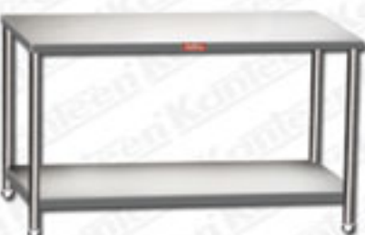
Work Table with 1 BS