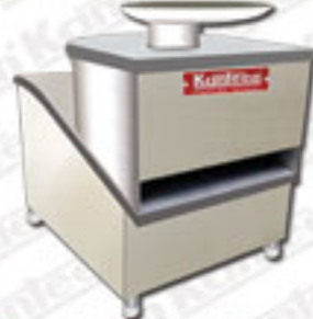
Potato Chips Slicer