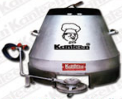
Gas Tandoor - Metallic