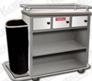
House Keeping Trolley