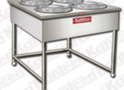
Bain Marie on Legs with Round Vessels