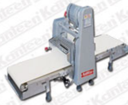
Dough Sheeter Table Top