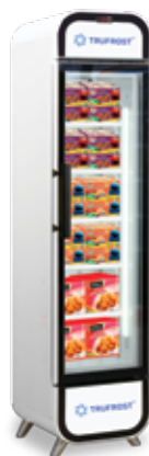
SVF-300 Slimline Visi Freezer