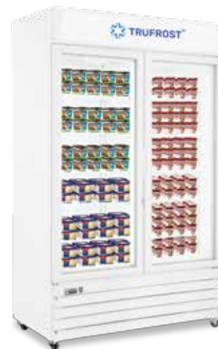
VF-1000 2 Door Visi Freezer