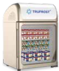
VF-100 Visi Freezer

Trufrost upright visi freezers are known for their reliability. VF 100 comes in an elegant champagne colour and the rest in an elegant white coloured body and provide a pleasing view of the displayed foodstuff – be it ice creams or any other packaged frozen food. You can choose between three models that are available in 100, 200, 400 and 1000 litre capacities and are fitted with LED lights to enhance the quality of display. VF 200, 300, 400 & 1000 come a ventilated cooling system with automatic defrost.