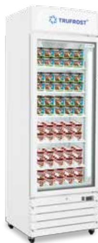
VF-400 Visi Freezer