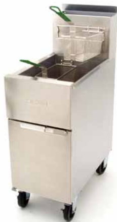
SR42G Shown with optional casters