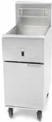
SR14E Shown with optional casters.