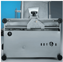
Underside motor protection plate