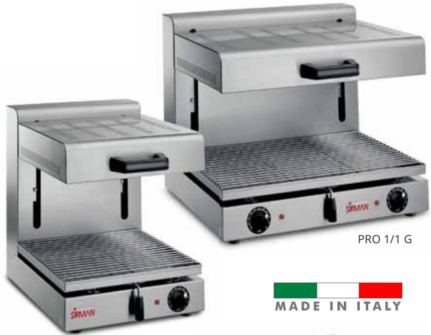
PRO 1/1 G