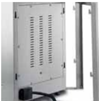
Pro models wall support